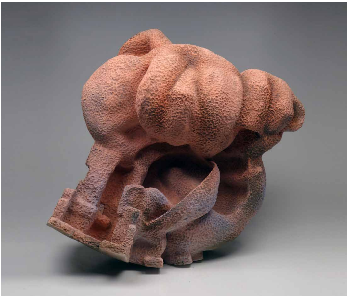
Darin Steege Abundance , 2016, stoneware, 24" x 27" x 14", $1200