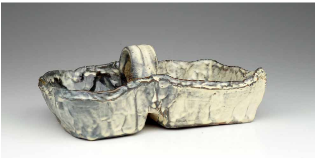
Andrew Kellner Divided Serving Dish , 2016, earthenware, 4" x 5.5" x 10", $65