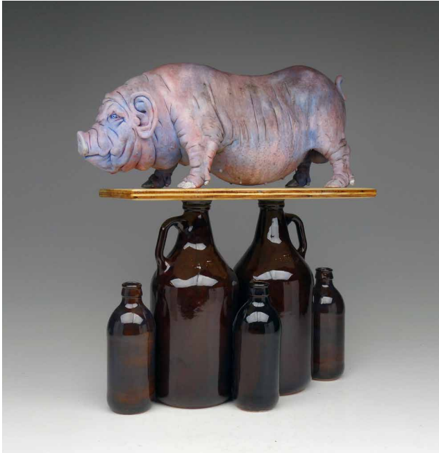
Travis Winters I'll Quit Tomorrow , 2016, earthenware, terra siglatta, glaze, stains, wood, resin, 15" x 17" x 7", $2700