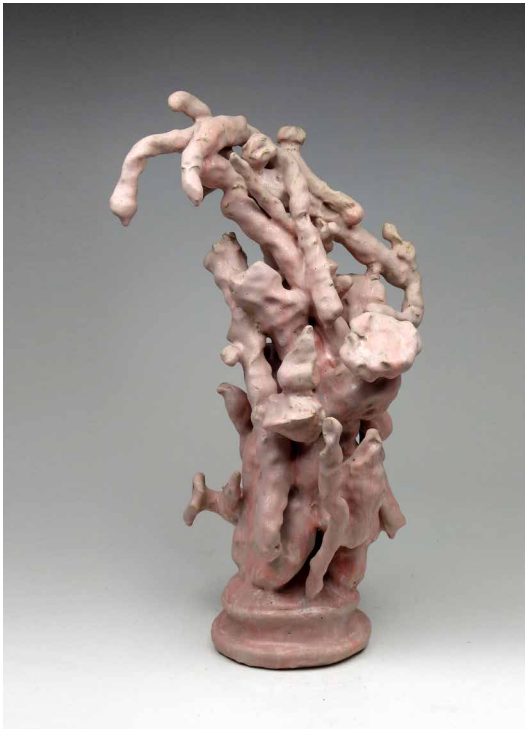
Zimra Beiner Suburban Rock (mauve b) , 2016, earthenware, glaze, 24" x 17" x 12", $1100