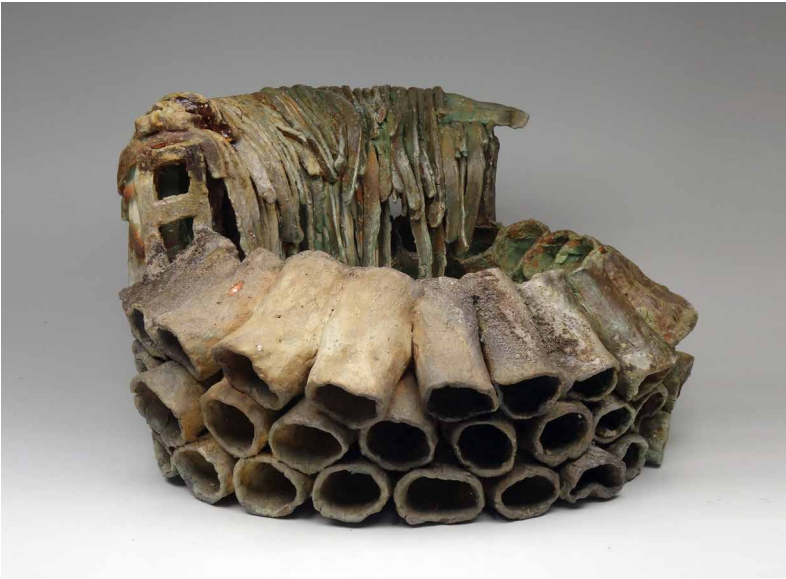
Craig Hartenberger, Ring with Accumulation , 2016, stoneware, slip, stain, 14" x 24" x 24", $5000