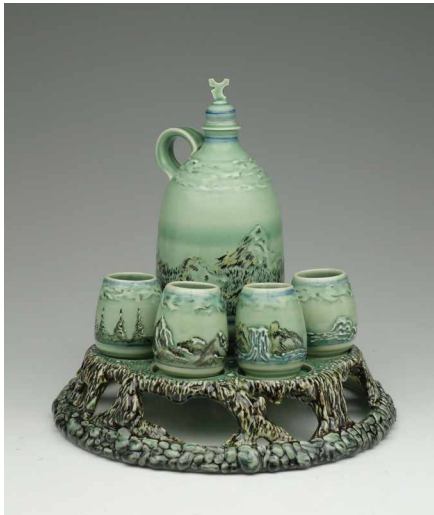
Spencer Ebbinga May the Clouds Touch Your Lips (Sake Set) , 2016, porcelain, slip, underglaze, celadon, 9.5" x 9.75" x 9.75", $500