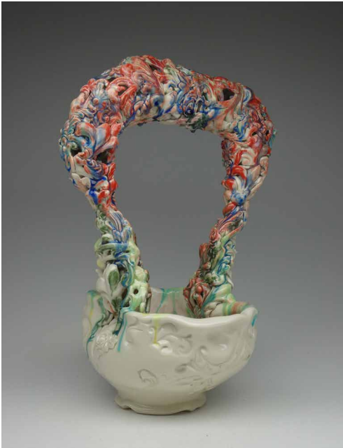
Joyce St. Clair Voltz Sprigged Basket , 2016, porcelain, underglaze, 22" x 12" x 12", $1000