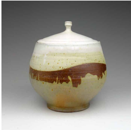
Brianna Shimer Landscape , 2015, wood fired stoneware, 10" x 8" x 8", $75