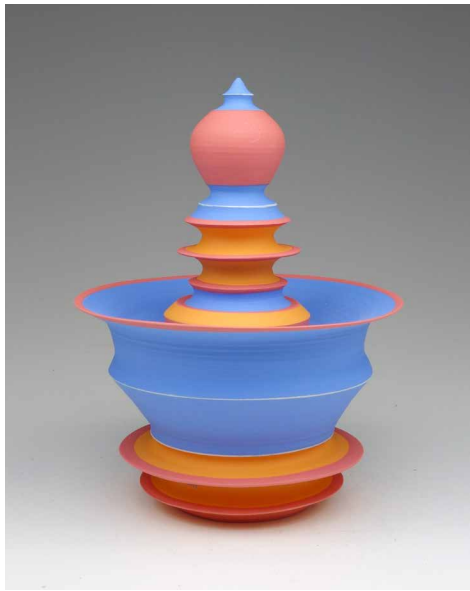
Devon Sullivan Mental-Portrait VII , 2016, ceramic, 11" x 6" x 6", $1600