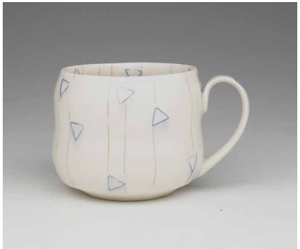
Rachel Donner Pink Mug , 2016, porcelain, 5.25" x 3.5" x 4", $65