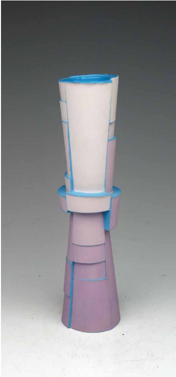
Kyle Johns Small Purple Vase , 2016, porcelain, 12" x 3" x 3", $180