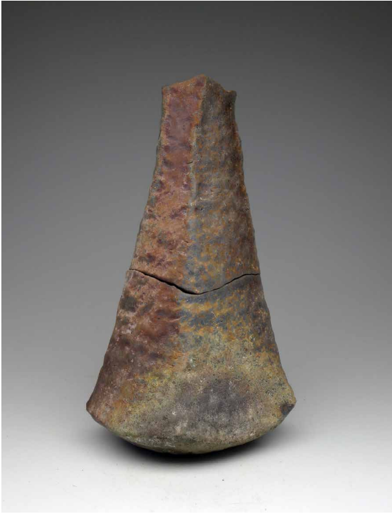
Shasta Krueger Mossy Box , 2015, wood fired iron-rich stoneware, 17" x 10" x 9", $285