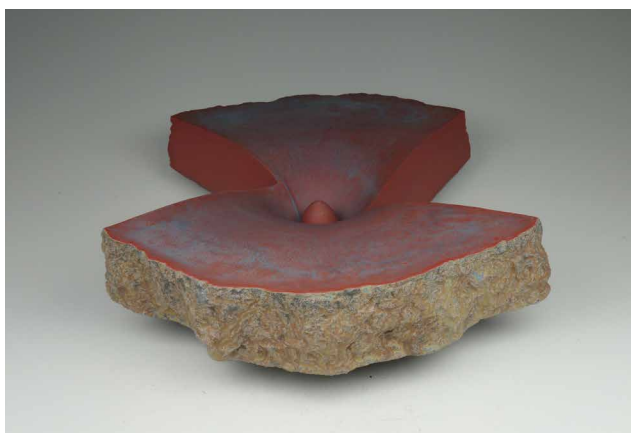
John Utgaard One Possible Theory , 2015, earthenware, glazed, 5" x 20" x 15", $1000