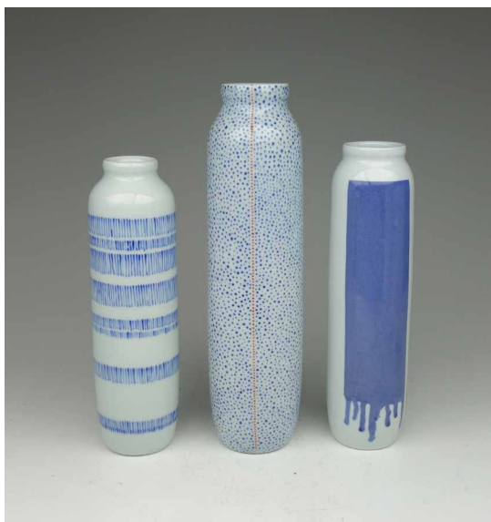
Tiffany Tang Triptych: Blue & White , 2016, porcelain, 13" x 11" x 3", $500