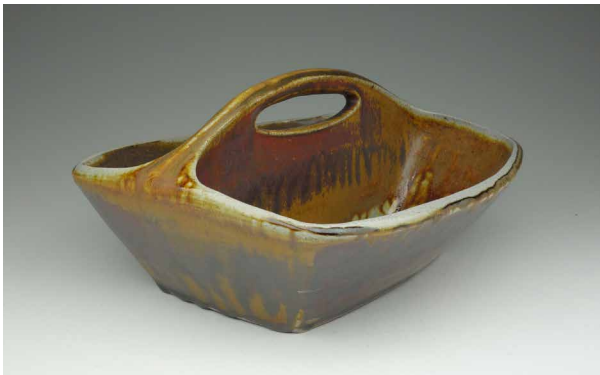
Lorna Meaden Tool Caddy , 2016, soda fired porcelain, 7" x 8" x 14", $235