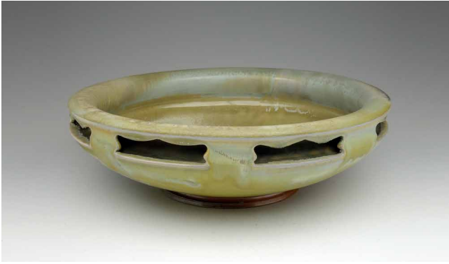
Andrew Chanania Bowl , 2016, wood fired, salt fired, soda fired porcelain, 4" x 13.5" x 13.5", $150