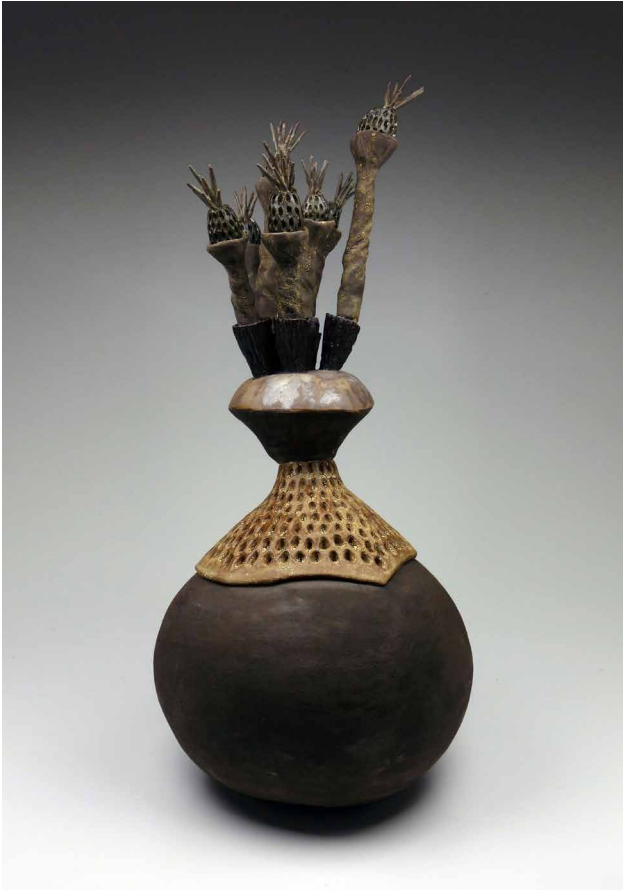
Megan Wolfe WGBW , 2015, terra cotta, 33" x 13" x 13", $1100