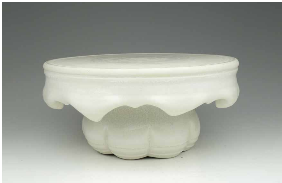
Aysha Peltz Cake Stand , 2016, porcelain, 5" x 10" x 10", $165