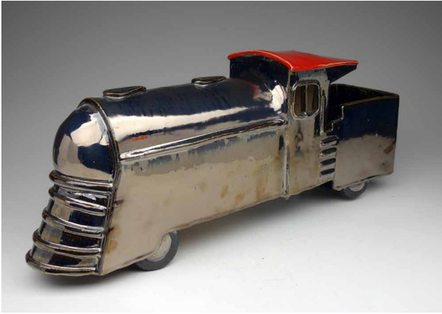
Wilbur Rehmann Slick Loco , 2016, stoneware, glazed, 6" x 11" x 27", $800