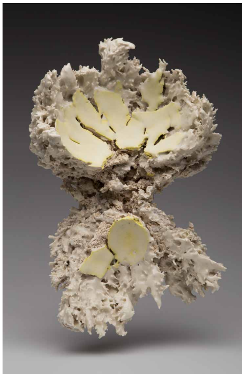
Brandi Lee Cooper Splayed , 2015, paperclay, underglaze, glaze, sand, 16" x 8" x 6", $480