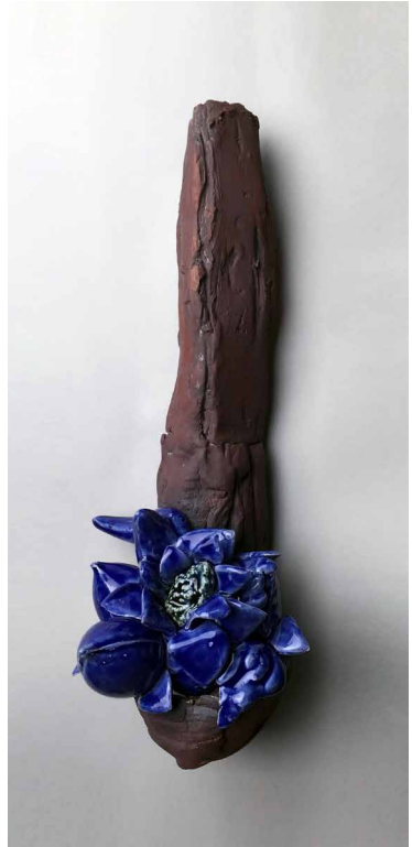
Shoji Satake AFS34_08_2016 , 2016, stoneware, slipcast, 3D printed, 11" x 3" x 3", $300