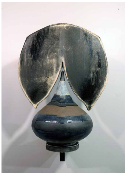
Leanne McClurg Cambric Black Tear Black Tulip , 2016, stoneware, wood, 24" x 18" x 10", $400