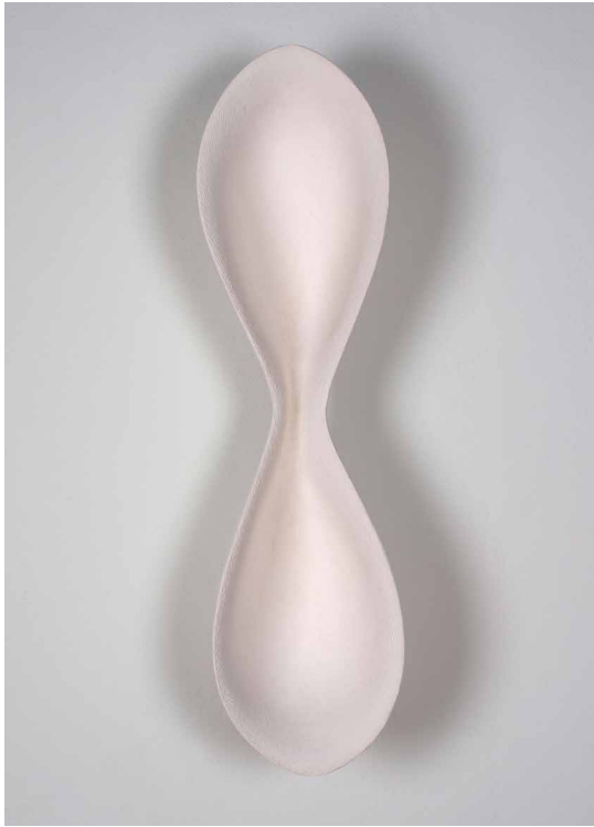
Sally Brogden SBB #1 Untitled , 2014, porcelain, 25" x 7" x 7", $700