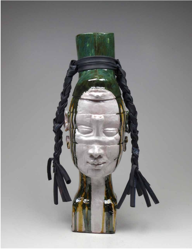
Heidi Moller Somsen Composite (Girl with Braids) , 2016, ceramic, bicycle inner tubes, 25" x 10" x 9", $1400