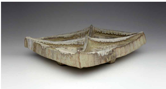
Joe Singewald Segmented Dish , 2015, wood fired stoneware, 2.5" x 10" x 12", $120