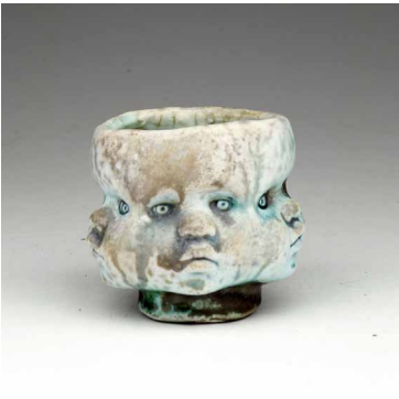
Amy Young Mixed Emotions , 2016, wood fired porcelain, 3" x 3.25" x 3.25", $300