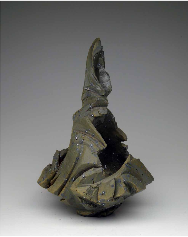
Lars Voltz Basin and Range , 2016, wood fired iron-rich stoneware, quartz, 22" x 13" x 13", $700