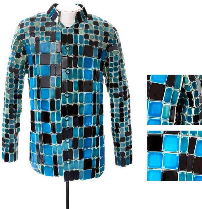
Shae Bishop Shirt , 2016, porcelain, underglaze, glaze, canvas, PE fiber, 30" x 19" x 9", $6900