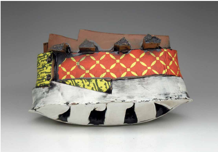
Jeffrey Thurston Beached , 2016, ceramic, 10" x 16" x 11.5", $1500