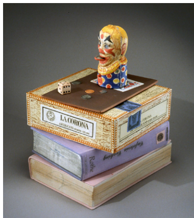
G.W.B and Other Clowns Jar