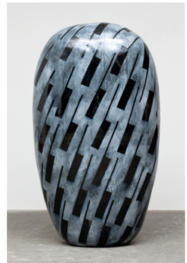
Jun Kaneko, Untitled

For further information about the event and a complete schedule of activities visit 60th.archiebray.org .