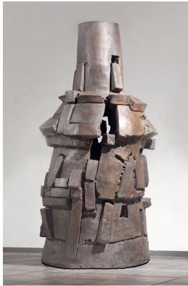
Peter Voulkos, Anasazi S13 , 2010, 76"x 35"x 36" This casting is a posthumous cast made in 2010 from a new mold that was made from the original ceramic in 2010. As per Peter's wishes, there are five in the edition with three APs (artist proofs) and one FP (foundry proof), making a total of nine in existence. The Bray will receive #2 from the edition, which leaves only two available.