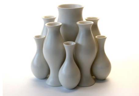
KleinReid, Eva : Centerpiece