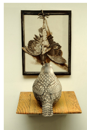
Myungjin Kim, Reflection Series 1