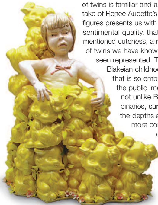
Doggypile ceramic and mixed media 20" x 16" x 14", 2008

Blakeian childhood innocence that is so embedded in the public imaginary. But, not unlike Blake's own binaries, surfacing from the depths are much more complex ways of twinning.