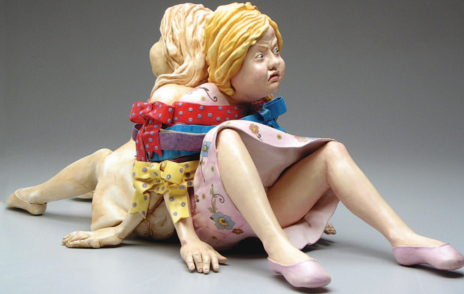
Tied to Myself ceramic and mixed media 16" x 34" x 14", 2008