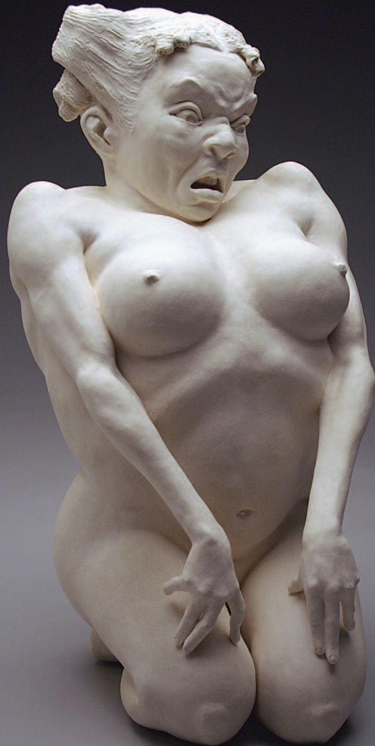
Tar Baby II ceramic and paint 26" x 18" x 20" 2008