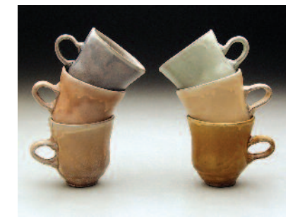
Mug Stacks Midrange redware, slip, glazes, oxidation fired each 4" h x 4" d, 2009