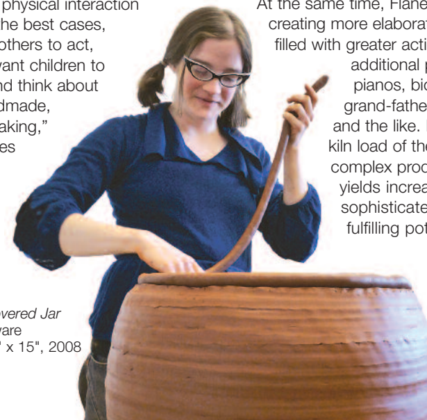
Large Covered Jar Earthenware 27" x 15" x 15", 2008