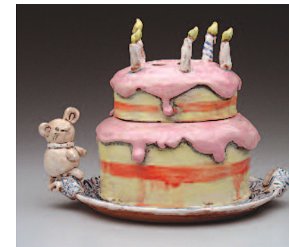
Birthday Cake Vase Earthenware 10" x 13" x 8", 2008

"I like the idea of affecting people's aesthetics early on when they're the most malleable,"