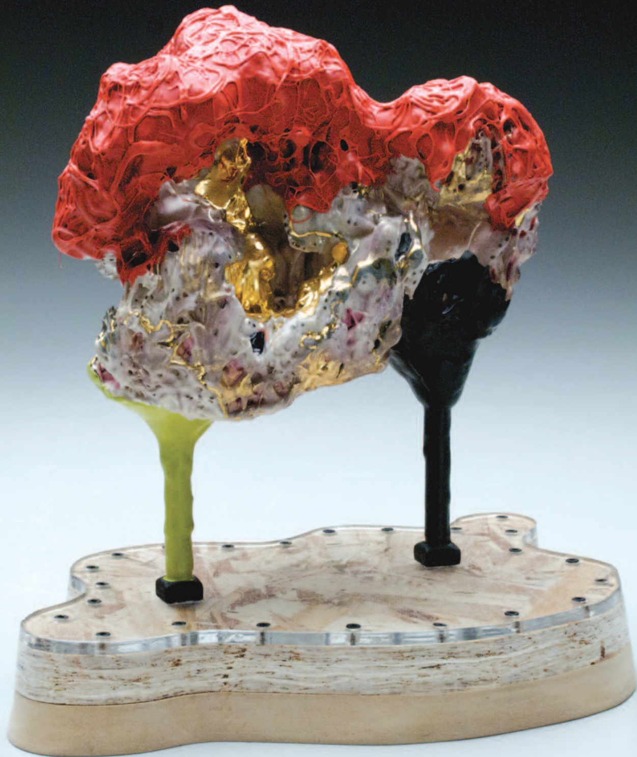
Left: The Locket of Circumstance ceramic, wood, plexiglass, epoxy, tool dip, hardware, gold luster 10" x 8" x 14", 2012