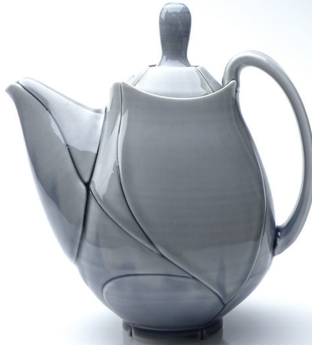
Right: Grey Leaf Teapot midrange porcelain 5" x 7" x 7", 2012