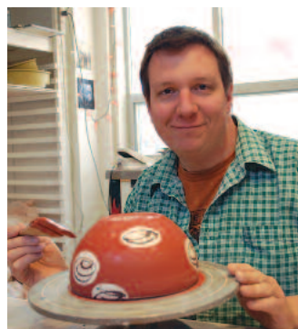
Right: Dish Stack porcelain, 12" x 12" x 5", 2012