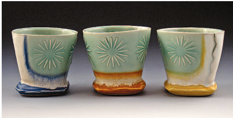
Rocks Glasses 2012, white stoneware each 4" x 4" x 4"

Pickett's sculptural vessels are visually accessible and invite handling from the viewer, but there is a slight departure from their functional practicality. Although his vessels offer "comfort"—inspired content depicted through soothing colors, forms and textures—Pickett suggests a "beauty before comfort" mantra regarding their utility. In the sense of technically functional items they are ordinary, but they are extraordinary in terms of their unique presentation. These vessels might be out of place at a formal dinner next to extravagant silverware and fine linen, but they could appear at an equally important occasion.