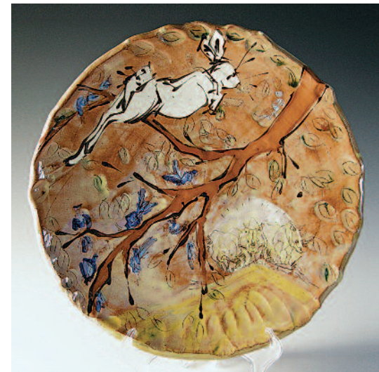
Rabbit Platter 2012, earthenware 14" x 14"