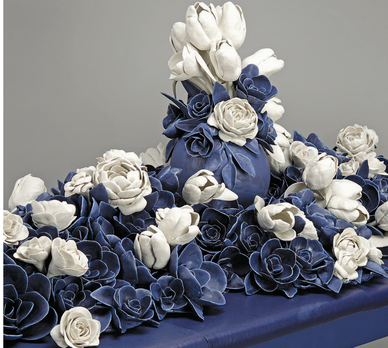
And Then It Was Still II 2012, porcelain, glaze, wood 50" x 60" x 24"