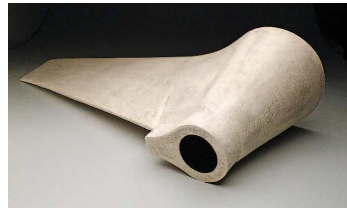
Wing 2013, diamond polished ceramic, stain, 43" x 12" x 16"