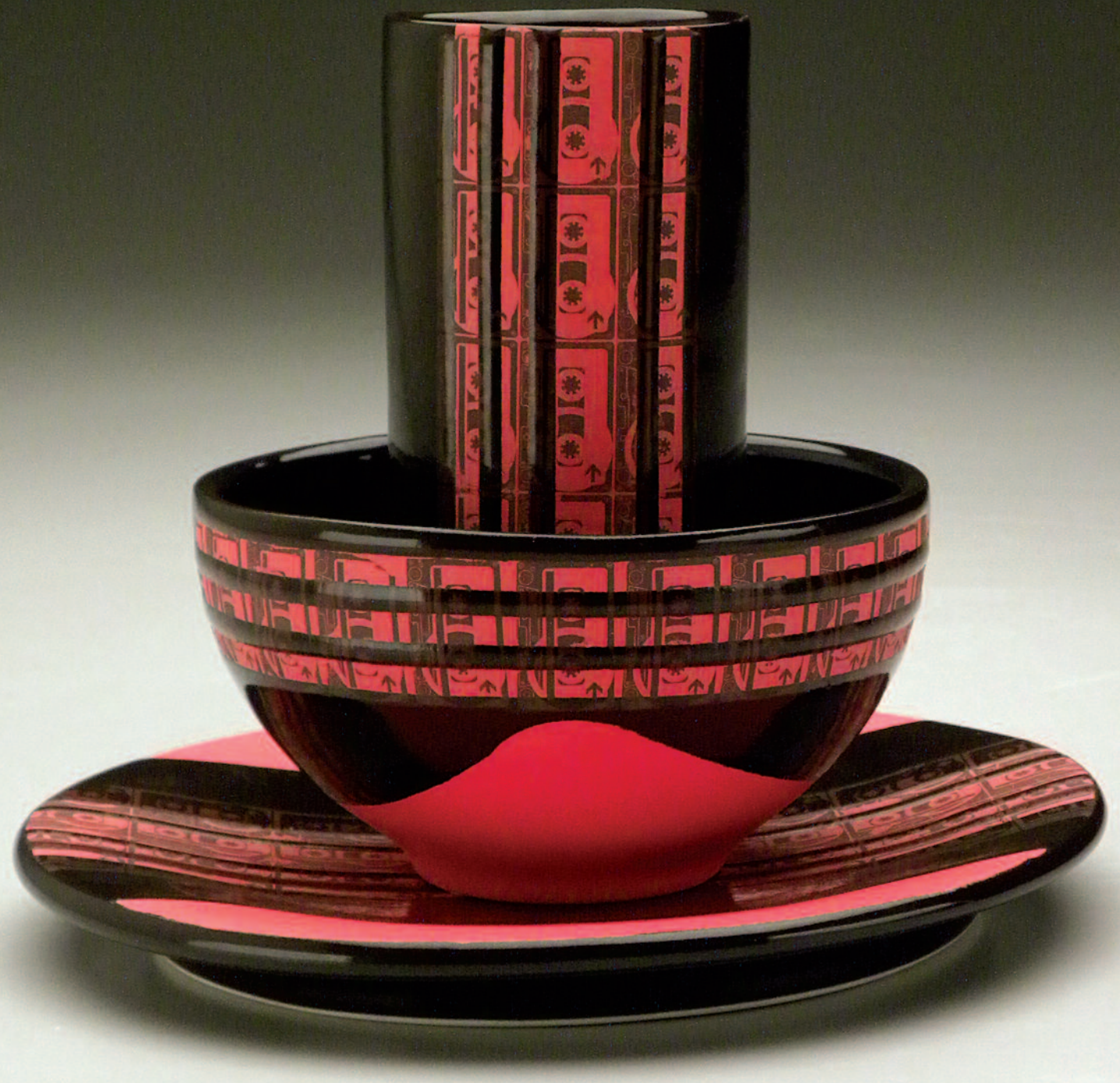
Mix Tape Lunch Set 2013, colored porcelain, laser transfers 6" height