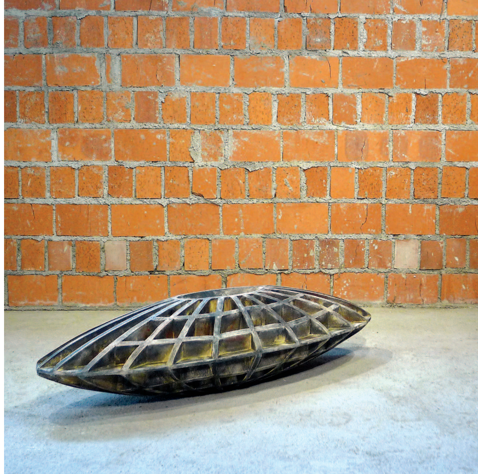
Ovoid #1 2013, ceramic, glaze, stain, 44" x 11" x 15"