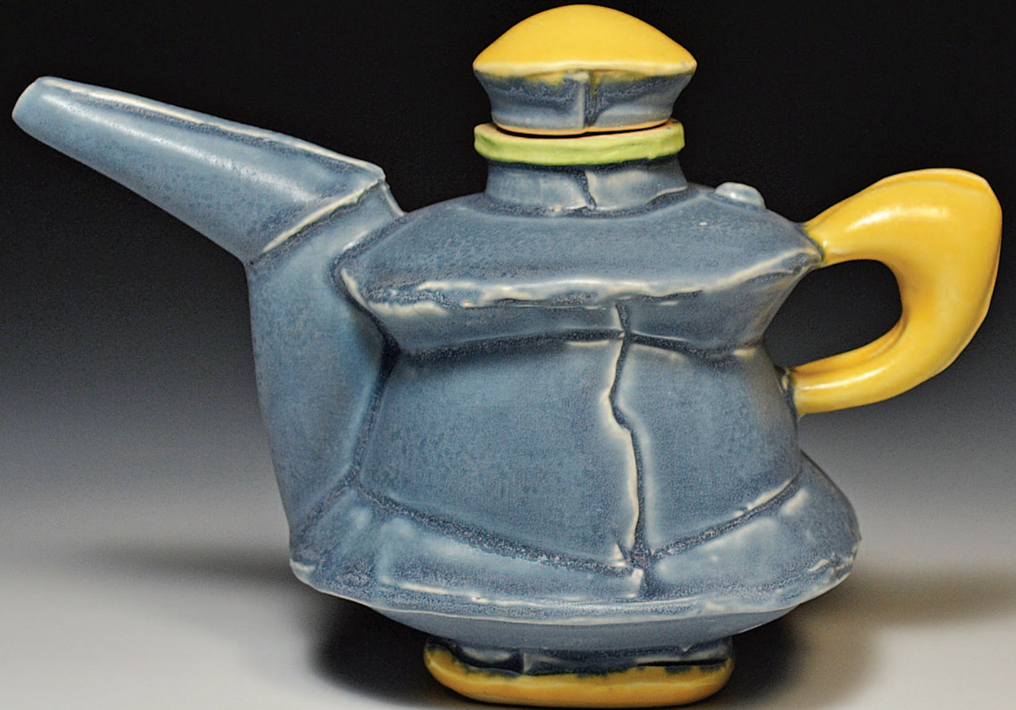
Oil Ewer 2013, white stoneware 6" x 7" x 4"