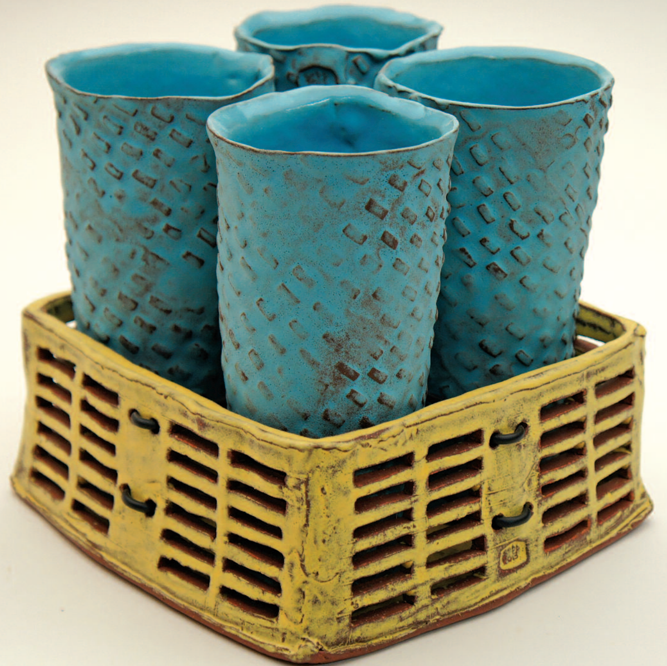
Cool-tumbler and tray 2013, red clay, glaze, cone 3, sandblasted, rubber coated wire 9" x 9" x 8"