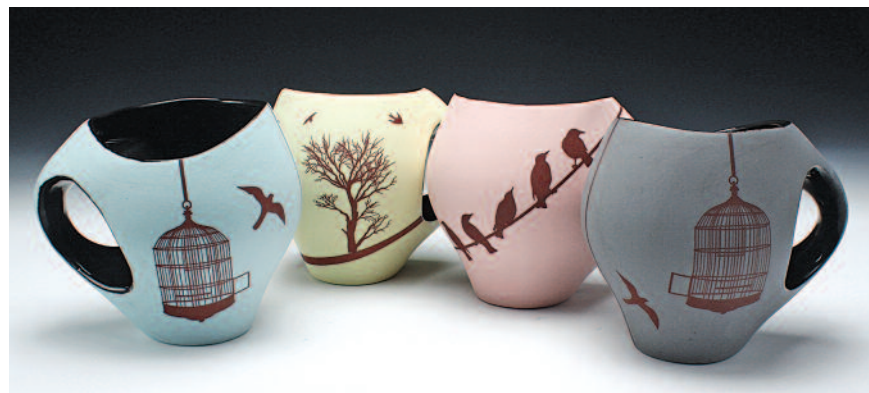
Lost & Found Mug Set 2012, colored porcelain, laser transfers each 4" x 5" x 4"