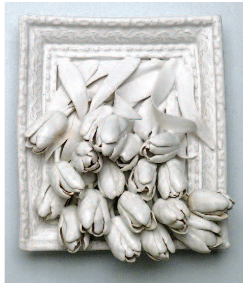
Frame with Tulips 2013, porcelain 13" x 11.5" x 5"

Hicks' use of the flower and floral motifs moves beyond pure investigation of decorative function in the home, but it still carries an unmistakable link to our perceptions of domestic femininity. Her work stealthily departs from the feminist genre but is careful to defend the root of its accomplishments. Hicks' bold use of complicated content and context elevates the textile and ceramic arts that are often trivialized for their function in domestic utility. We bring flowers into our home to capture something pretty; Giselle Hicks brings flowers into her objects to remind us to capture something beautiful.