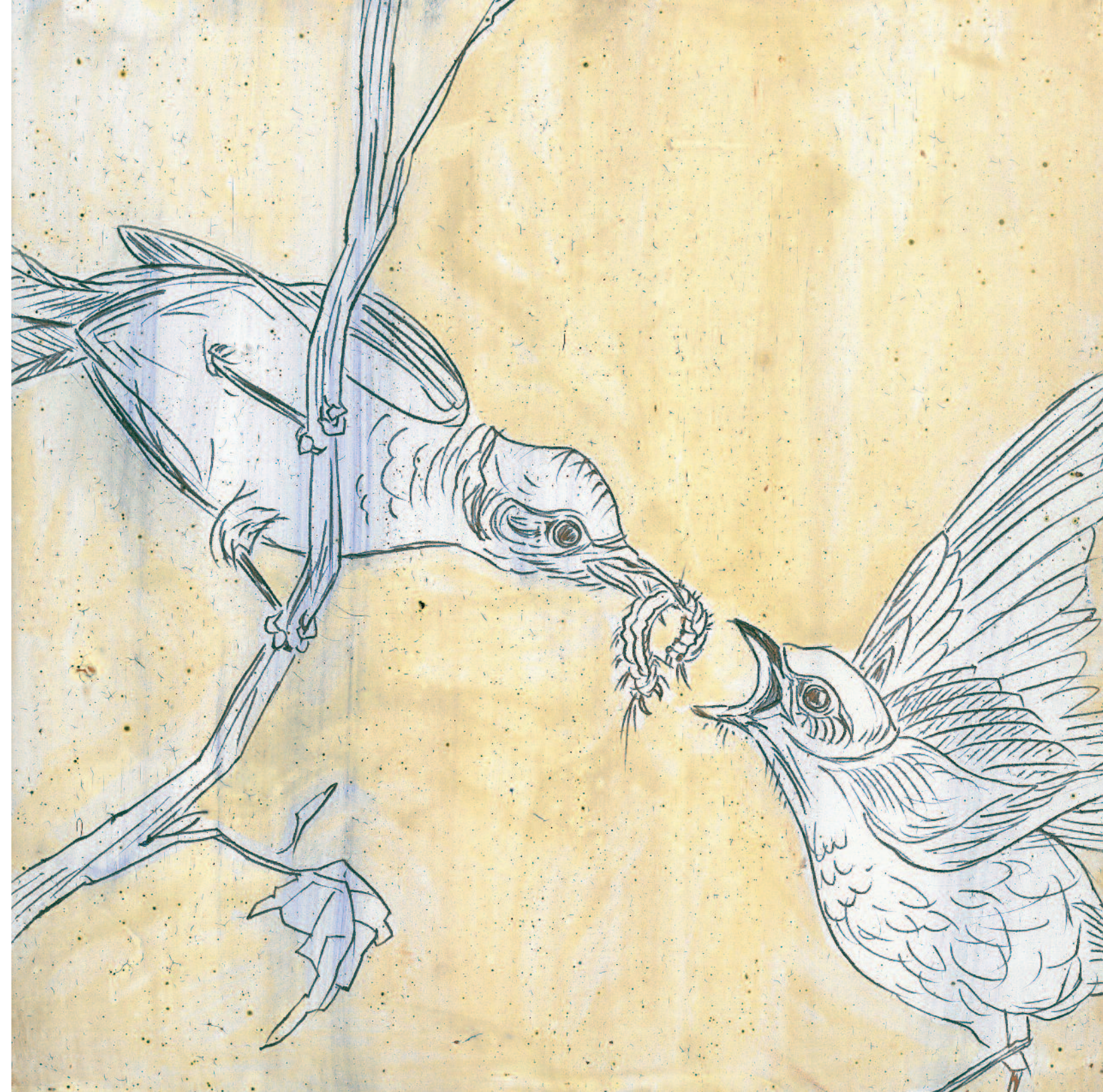
Bird Tile 2013, earthenware 12" x 12"

The tiles read as if we were flipping through the journal of a 19th-century naturalist, a departure from her singular wildlife studies captured on the surface of vessels. Griffin constructs an entire ecosystem of unusual pairings of birds and insects, often mating and devoured by prey in the same scene. Her playful narrative balances artistic liberty and a sense of adventure through a naturalist’s illustrative depictions, showing an ability to display fact and fiction, reality and fantasy for the viewer’s delight. Quick to smile, Griffin shares some of the fantastic species discovered just recently by scientists. Perhaps this new wildlife will work its way into Griffin’s future drawings.