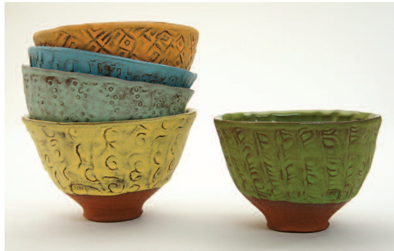
Bowls 2013, red clay, glaze, cone 3, sandblasted 5" x 5" x 5"

commercial intensity to the flesh-like qualities of weathered beach glass. Cobb’s techniques give us an artificial sense of wear and tear on a retro color palette of baby blues, creamy oranges and chartreuses, which speaks to a generation that recalls shag rugs and station wagons in faded photos. The final hand sanding exposes the stamped surface patterning, throwing rings from the potter’s wheel and the pinched seams of overlapping clay—a reminder that Cobb’s fingers have molded every inch of the vessel.